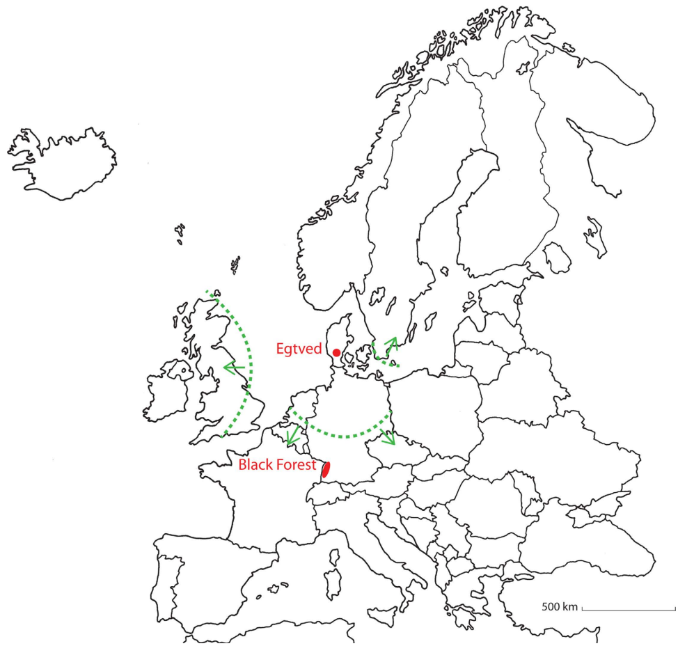
Figure 1. Map showing the location of the Egtved burial site (red dot). Borders of the nearest areas with bioavailable ^{87}\text{Sr}/^{86}\text{Sr} values that potentially fit the tooth enamel, the child's bone, wool garments and oxhide belonging to the Egtved find are marked with green lines and arrows. Of these regions the Black Forest area (red ellipse) appears to be the most plausible place of origin as constrained by the multiple strontium isotope codes contained in materials from the Egtved find combined with the archaeological artefact record patterns. (Drawing by Marie Louise Andersson, with kind permission of the National Museum of Denmark).