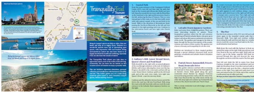
Figure 1. Leaflet describing Tramore TT.