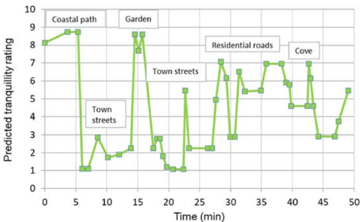
Figure 2. Tranquillity rating profile.

Fifty-three completed replies were returned. Over half (53%) considered tranquillity on the route “very important,” and 43% considered it “fairly important”. The average rating over the whole route was 7.1 (i.e. “good”). It was considered by 81% of the respondents that they were “more relaxed” after completing the TT and 41% indicated they were “less