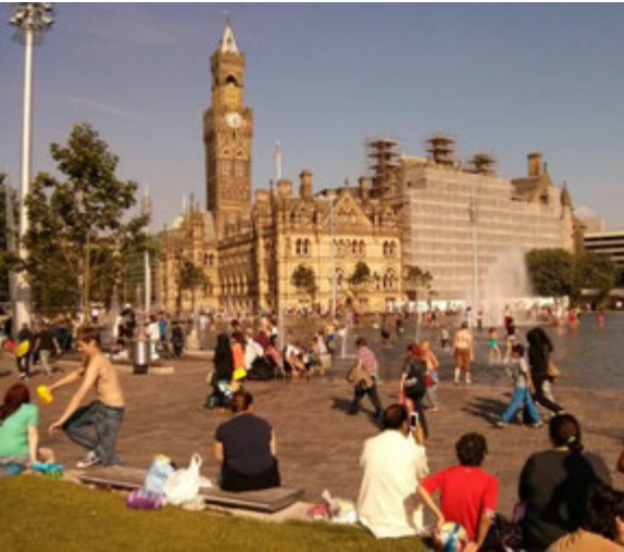
Figure 3.2: City Park on a warm summer's day, 2013

Beyond concerns about how the Mirror Pool is used, a local business employee thought standards of behaviour in general were too lax: 'You could walk around in your underwear and I don't think anybody would say anything to you.' This person also thought there were cultural differences between white and Asian notions of acceptable behaviour: