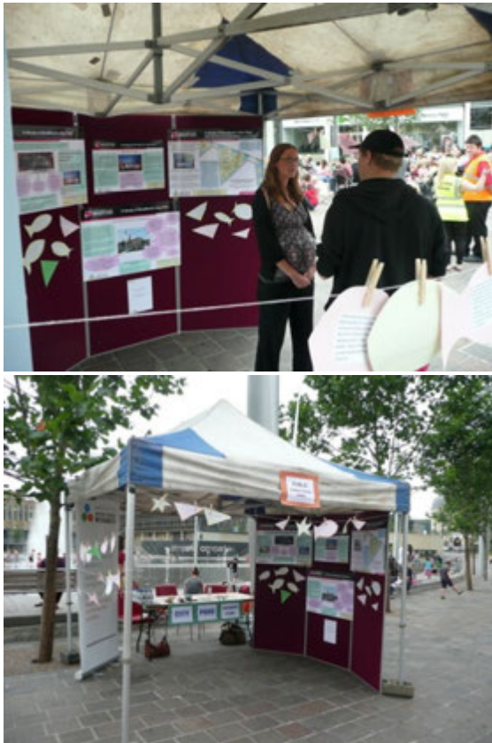
Figure 1.2 Public consultation event

people’s comments, chat with the research team and make comments of their own.