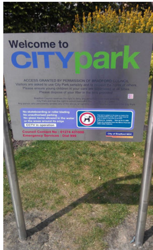
Figure 4.1 City Park's rules and regulations

The main rule that has been introduced relates to the use of glass items in and around the Mirror Pool given the danger this presents to children playing in the water. Dogs are to be kept on leads at all times and are not permitted in the Mirror Pool. Young children are expected to be supervised at all times by their guardian mainly due to the risk presented by the water. More broadly, the public notices warn visitors that 'disruptive' behaviour (undefined apart from the specific restrictions listed) may lead to those responsible being escorted off the premises and, where behaviour persistently flouts the park's restrictions, people risk being excluded from the space.