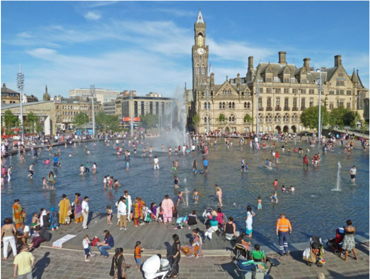
Figure 4.2 Children playing in the Mirror Pool and water fountains on a summer day