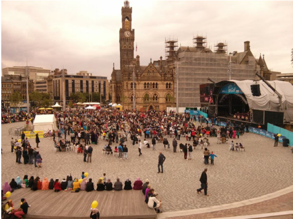
Figure 3.1: City Park during the Bradford Festival, 2013