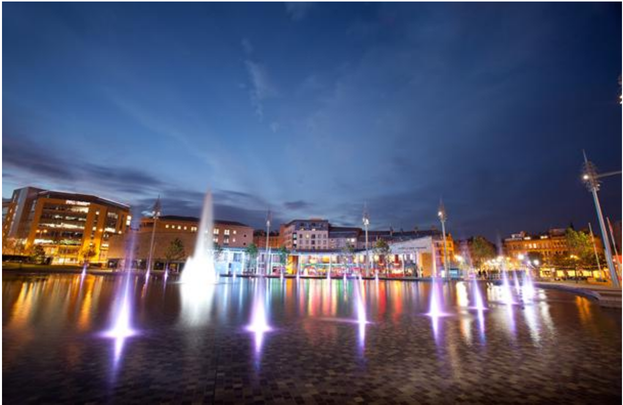
Figure 2.1 City Park at night

The dereliction and inactivity surrounding the former Odeon cinema building which runs along the western edge of City Park was commented upon by several people (see Figure 2.2).