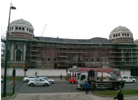
Figure 2.2: The former Odeon cinema

The dereliction and inactivity surrounding the former Odeon cinema building which runs along the western edge of City Park was commented upon by several people (see Figure 2.2).