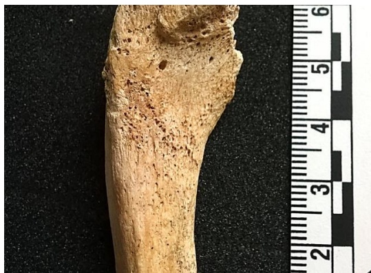
Figure 4 Possible pseudofracture on the lateral part of the right clavicle in Box Lane skeleton 44(A) of the Box Lane population.

In Box Lane the only possible occurrence of vitamin D deficiency was detected on skeleton 44(a). A large (c. 1.5 cm long) possible pseudofracture across the lateral portion of the right clavicle was the only indication of osteomalacia on the skeleton (figure 4). This appearance could be taphonomic, as the relevant radiograph (figure 5) presented no evidence of healing (no radio density on the margins of the fracture), however this does not preclude a diagnosis of osteomalacia (Jennings et al. 2018). This skeleton was extremely fragmented and highly incomplete, which is common in osteomalacia. This case was classified as possible vitamin D deficiency.