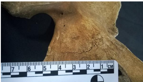
Figure 6 Possible pseudofracture on the left pelvis on skeleton 4 of the Chichester population.

There were two cases of vitamin D deficiency in the Chichester sample: one possible and one probable. The possible case regarded an osteomalacic pseudofracture detected on skeleton 4 (figure 6). Specifically, a large (c.2.5 cm) possible pseudofracture was observed on the dorsal portion of the left os coxae above the obturator foramen, and there was no similar pseudofracture on the right os coxae. Similarly to the Box Lane case the appearance could be taphonomic. However, in this case the radiograph presented a slight thickening of the bone with evident radio density on the margins of the fracture (figure 7). The singularity of the element and the weak evidence of healing classified the case as possible and not probable osteomalacia.