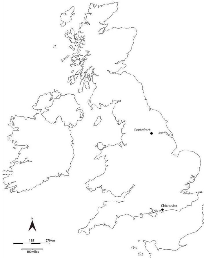
Figure 1 Map showing the location of Chichester and Pontefract.

Magdalene hospital, Chichester, West Sussex. Both collections are pre-examined and curated by the University of Bradford.