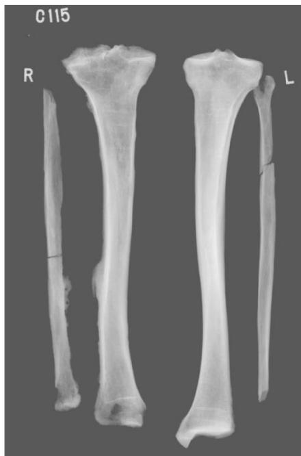
Figure 9: Radiograph of bowed tibiae (Chichester 115), showing thickening of the cortical bone.

The prevalence of vitamin D deficiency was investigated statistically using true prevalence rates (TPRs). 27 individuals from Box Lane and 58 individuals from Chichester were deemed sufficiently complete to be included in the calculation of TPRs. A summary of the occurrence of the deficiency within each population is depicted in table 1. A Fisher’s Exact test was followed due to low cell counts; p=0.688 . These results indicate that the distribution of the deficiency does not differ significantly between the two populations.