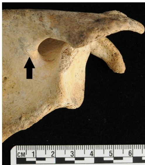
Figure 3 Example of healed osteomalacic pseudofracture