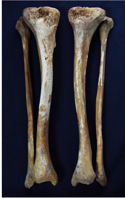
Figure 2 Example of bilateral bowing of the tibiae and fibulae caused by residual rickets. There is some post-mortem damage to the cortex, especially of the right tibia

recording helped produce an accurate statistical analysis, while solving the problem of varied skeletal completeness that is so common in palaeopathology.