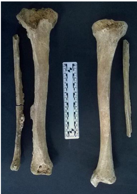
Figure 8: Bowed tibiae of Chichester 115