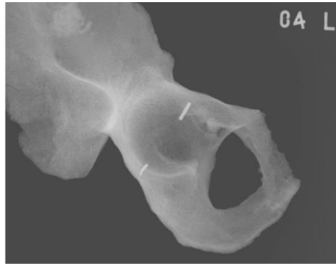
Figure 7 Radiograph of left pelvis of Chichester 4. The arrow points to the possible pseudofracture.

The only case of probable vitamin D deficiency was a diagnosis of residual rickets on skeleton 115. This skeleton presents bilateral medial bowing of the tibiae that creates an “S” shape on the anterior borders (figure 8). The diagnosis is supported by the thickening of the cortical bone of the affected elements as a biomechanical change, which is evident on the radiograph as radio density in the area (figure 9). A report for this skeleton has been written and published by Knüsel and Göggel (1993). However, the pathological observations focused on the multiple trauma throughout the skeleton. It is noteworthy that the authors did not suggest rickets as a possible pathology that could explain the bowed appearance of the tibiae. Furthermore, other pathological evidence leading to a diagnosis of residual rickets were detected radiographically in the form of thickening of the cortical bone on the tibiae. It should be noted that the decreased radiodensity of the left tibia is probably a result of disuse atrophy following fracture and osteomyelitis of the left femur, and it is not connected to the metabolic condition.