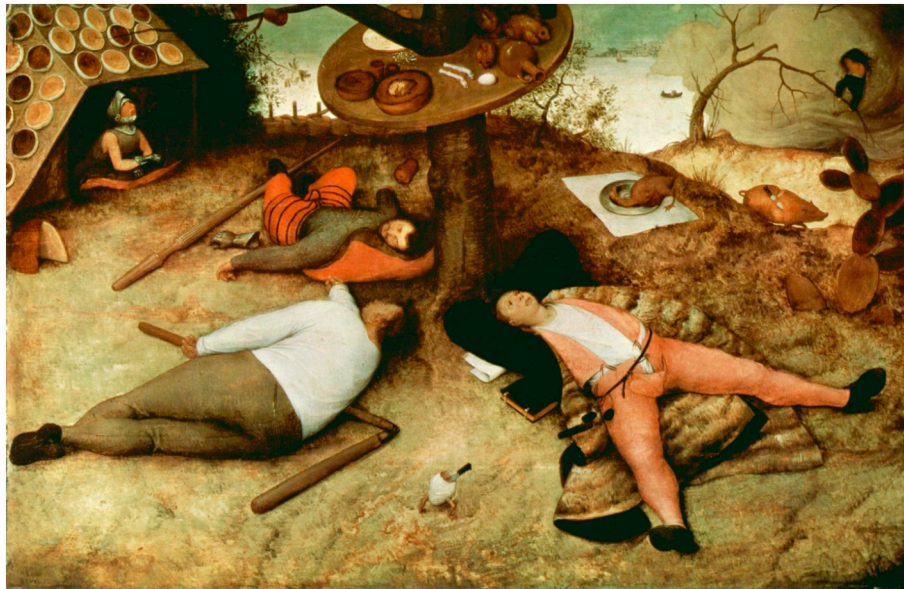
Fig. 1. The Land of Cockayne, Pieter Bruegel, 1567.

in 1928 by the singer Harry McClintock, but was written in 1905 based on earlier oral traditions (Raulerson, 2013).