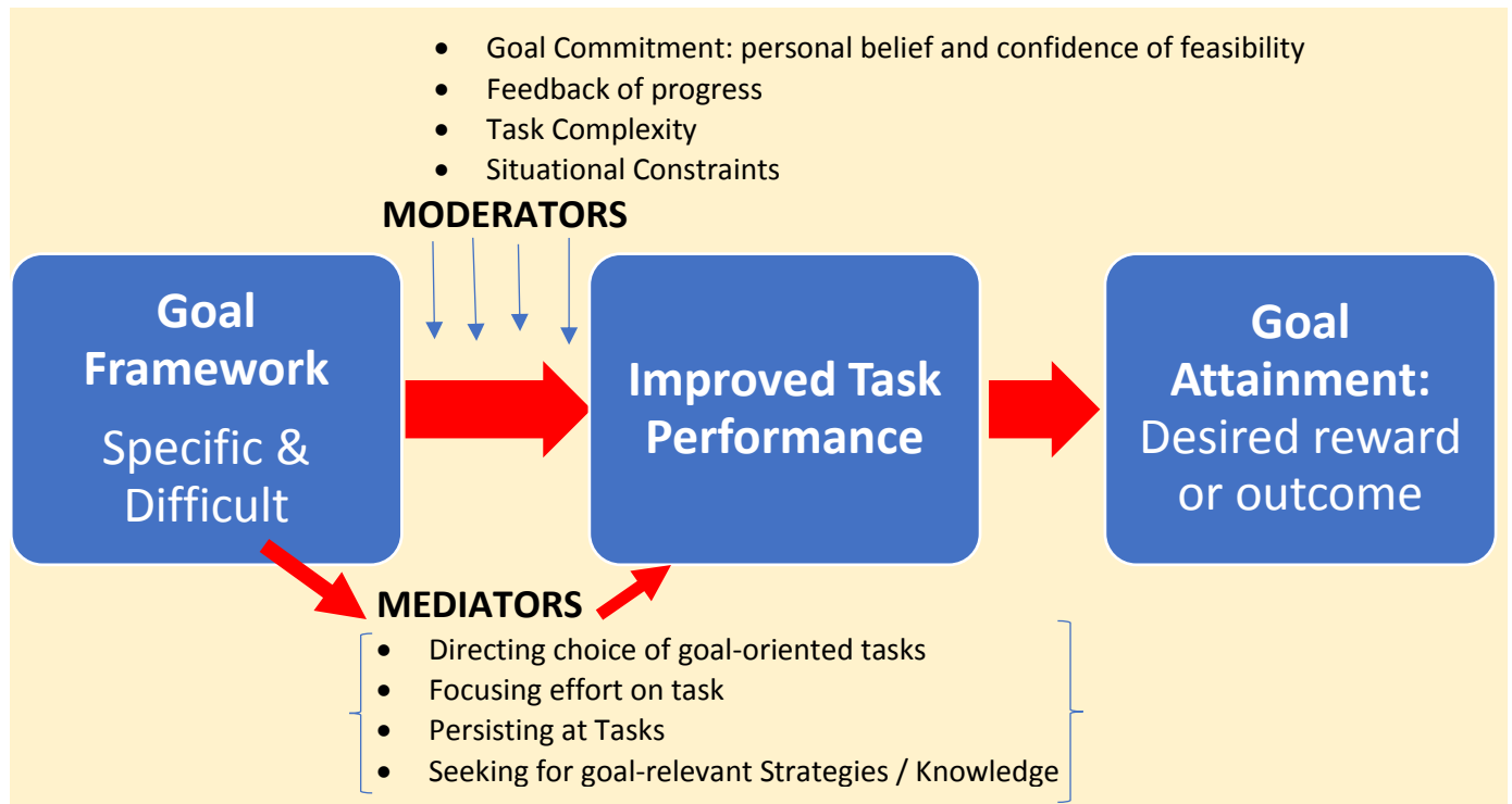
Figure 2: Goal-setting Theory (adapted - from Locke & Latham 2002)

Moreover, the constructs of the goal-setting theory (Figure 2) provide evidence that the key philosophical reasoning behind goal-setting is its power to motivate the behaviour and effort of workers that are required as goal mediators to improve action performance towards achieving the desired changes or outcomes in any work-related setting (Locke & Latham, 2006). The Locke and Latham's (1990) theory indicates that the desired goal effect only occurs when the goal framework is formulated to be specific and challenging, and where the necessary moderating factors are in place in the practical context of the organisation (Figure 2). According to Locke and Latham (2006), "So long as a person is committed to the goal, has the requisite ability to attain it, and does not have conflicting goals, there is a positive, linear relationship between goal difficulty and task performance" (p. 265).