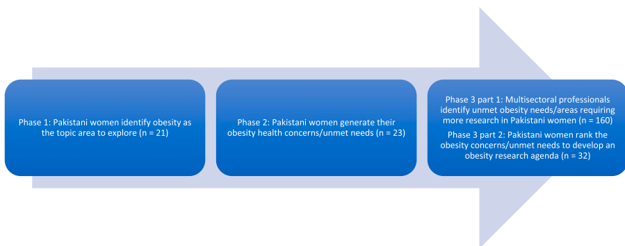
Figure 1. Phases of the research.

It is widely recognised that collaborative research practices such as coproduction should be promoted. Coproduction is supported by ethical and practical reasoning (Flinders et al., 2016). However, there is a lack of consensus about what coproduction is, how it should be done, and its effects on the research. Researchers coproduce with stakeholders in multiple ways, however, some approaches involve little interaction such as when stakeholders are mere recipients of research findings. Others interactions are more active such as seeking advice about policy agendas, or, stakeholders are equal partners in the research relationship (Oliver et al., 2019) which is regarded as true coproduction. There is limited evidence about the impact of strategies deployed by researchers in coproduction. There is, however, literature outlining limitations of performing coproduced activities such as the amount of time and resource involved (Oliver et al., 2019); difficulties in involving communities due to misaligned goals, power (Fuentes, 2019), and knowledge (Kääntemä and Kääntemä, 2018).