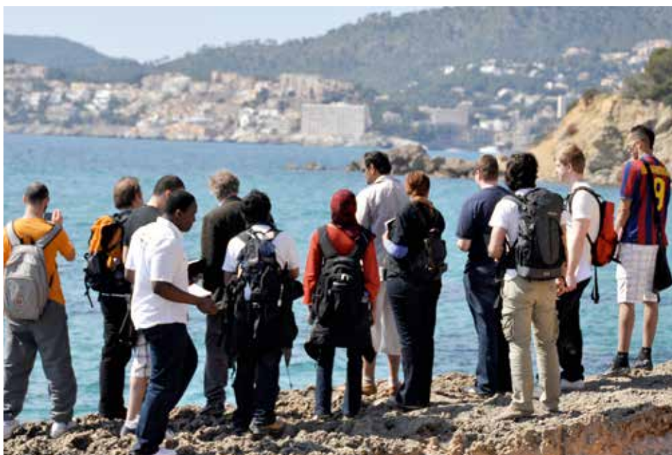
Students hard at work 'reading the landscape' on Santa Ponça beach.

So did it work? The cohort I took on fieldwork were notably more willing to contact