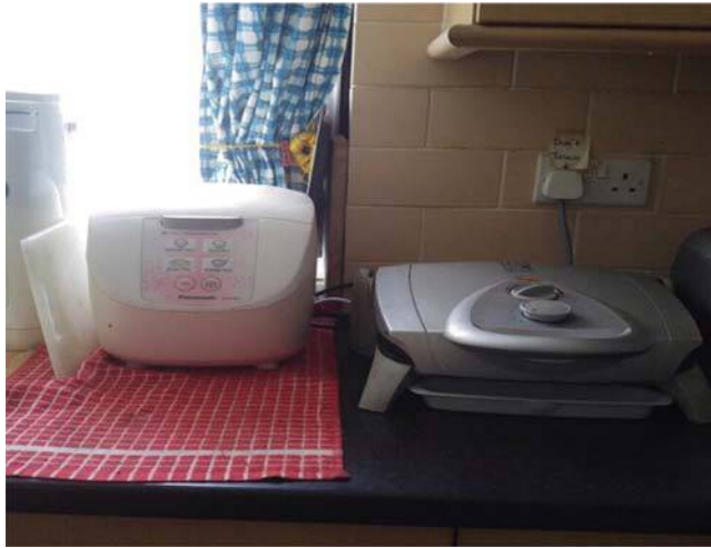
Plate A2. Farid's house has got rice cooker and grilled machine next to each other