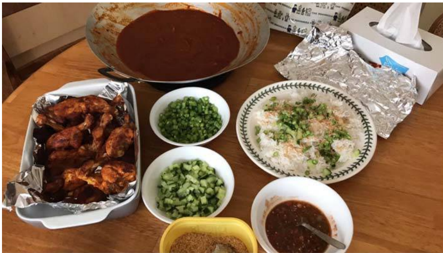
Plate A1. Farid's diner table – fried chicken for Farid is kept with rice and spicy curry